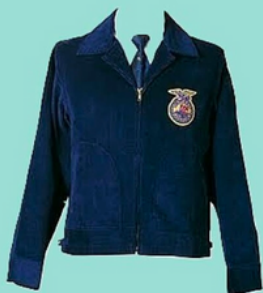
official FFA jacket zipped to the top