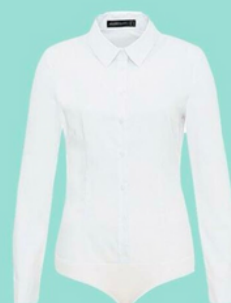
white collared blouse