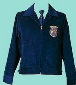
official FFA jacket zipped to the top