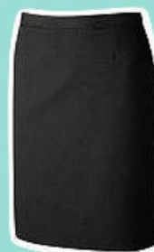
black skirt (no more than 2 in. above the knee)