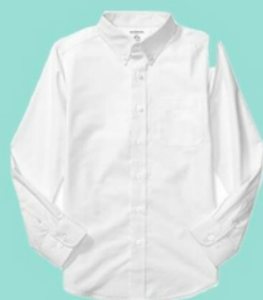
white collared shirt